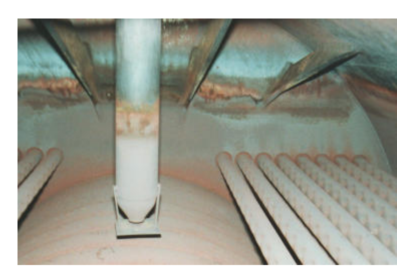
Shell boiler with the application of FINEAMIN®