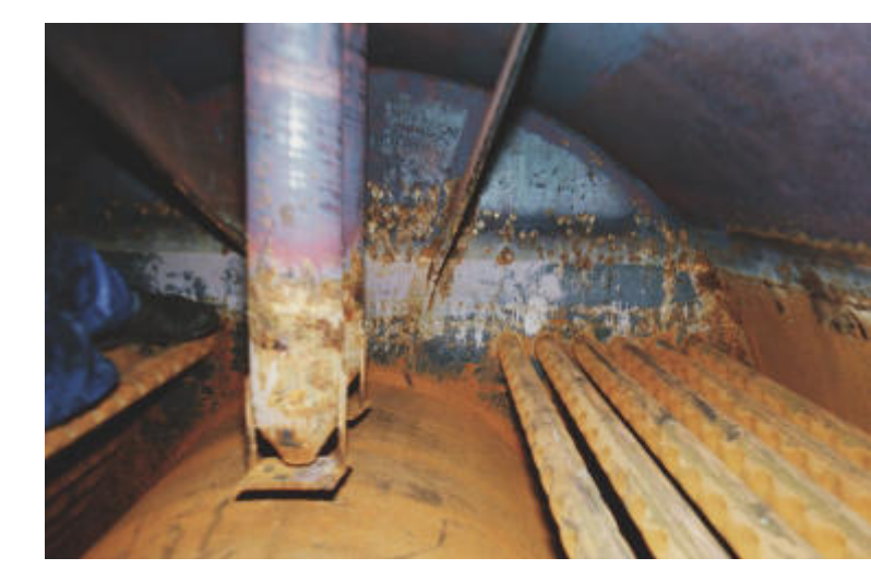
Shell boiler before the application of FINEAMIN®

This means for you: no effort, no storage costs and no disposal